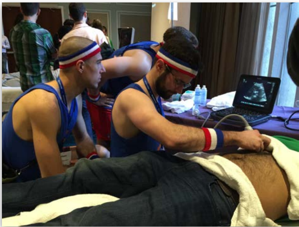
University of Pennsylvania