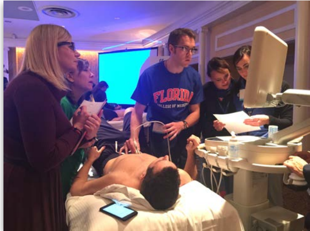
University of Florida-Gainesville